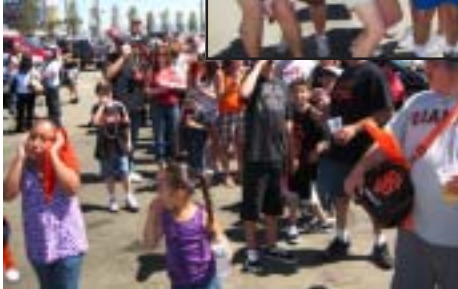
SF Giant's Tailgate Party!